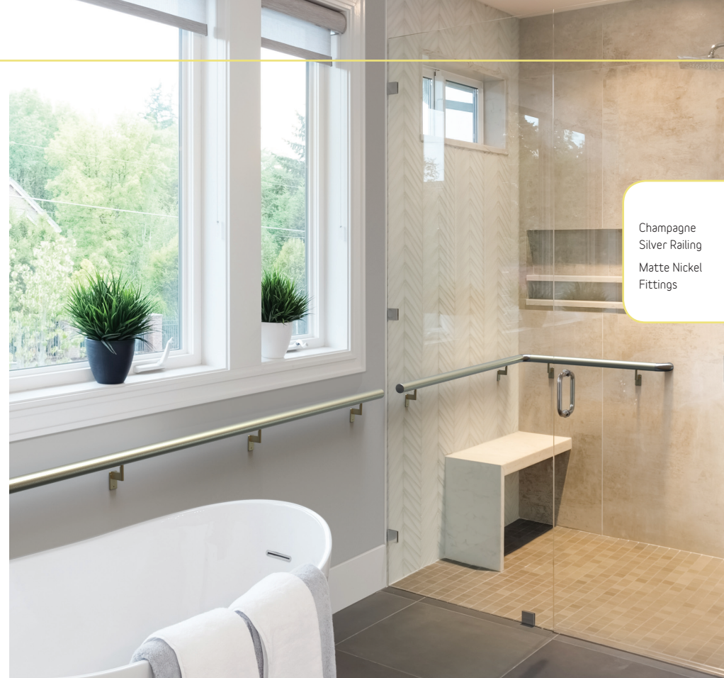
Champagne Silver Railing Matte Nickel Fittings

Welcome to handrails with a social conscience. Promenaid is manufactured in North America from 100% sustainable materials including aluminum, the world's most recycled product. Our revolutionary TrueWood™ handrails, featuring durable aluminum railing wrapped in real oak or walnut, require 50 times less hardwood to produce than solid wood.