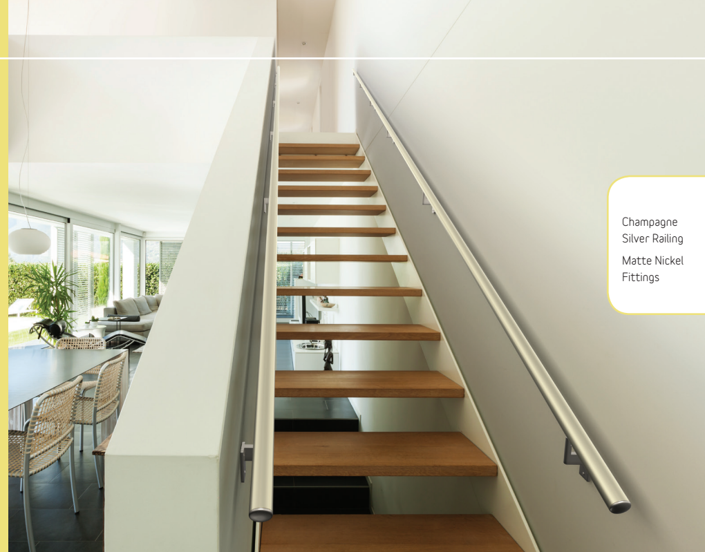
Champagne Silver Railing Matte Nickel Fittings

Welcome to a new era in freedom of movement. A breakthrough in personal mobility — with Promenaid™, people of all ages have a helping hand to move freely about the house. The world's first code-compliant continuous handrail combining elegance, versatility, and easy installation, Promenaid™ handrails can climb stairs and navigate any corner or change in slope so you can safely go where you want to go.